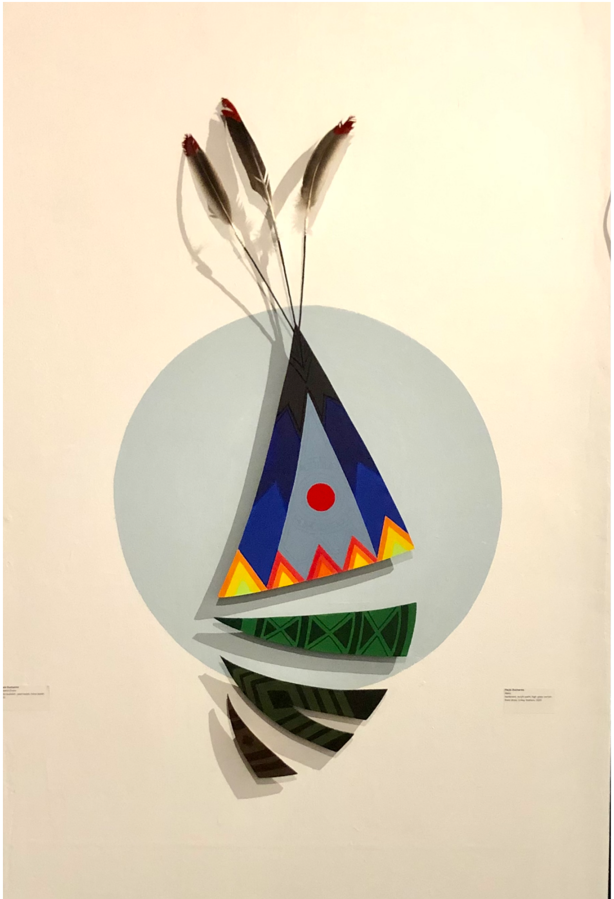
Native American Headdress Cutout