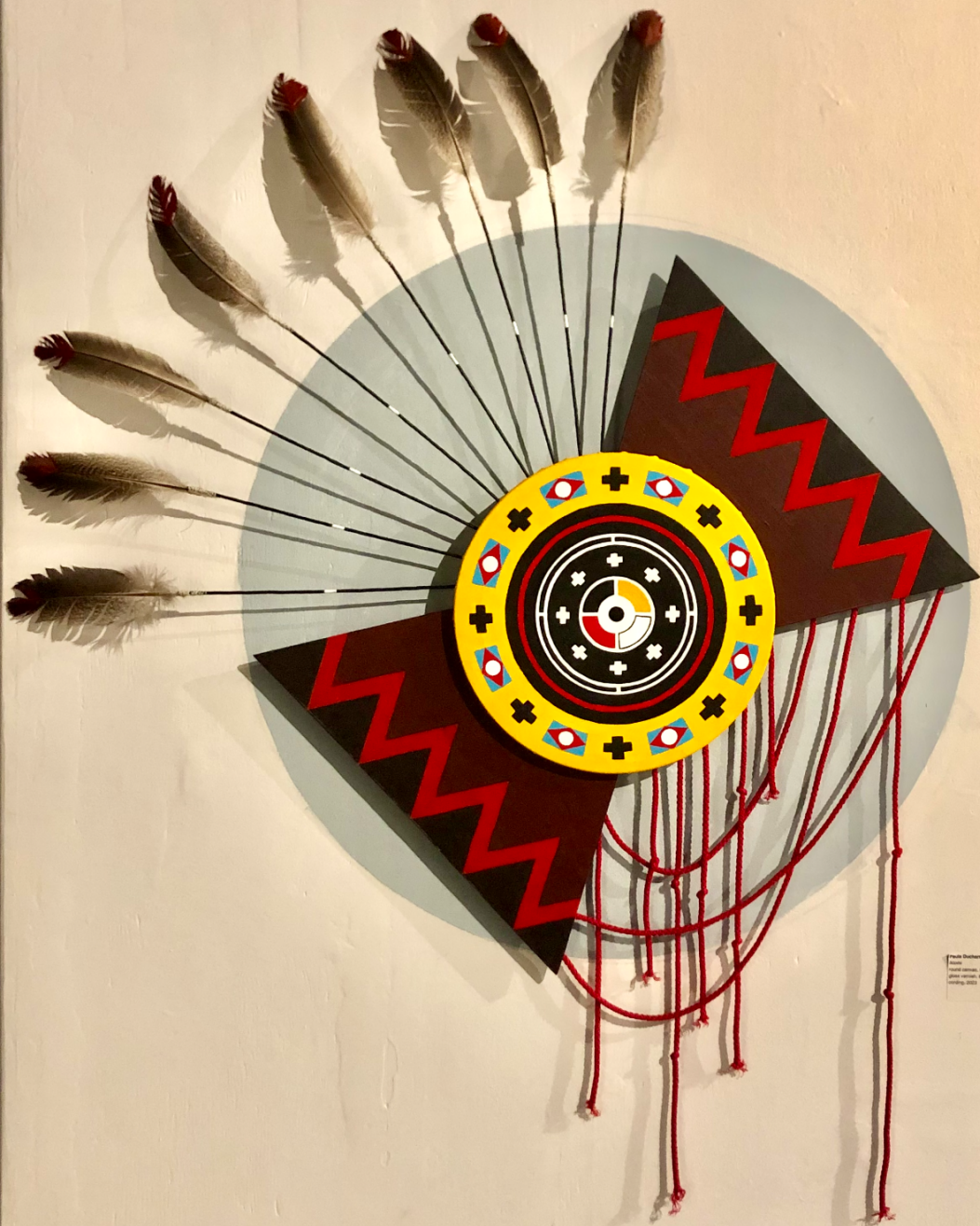
Prince Dordane "Dordane" (2013) Feathers, cotton, wool, acrylic, wood, glass, paper 100 x 100 x 10 cm Installation view, Prince Dordane, 2013